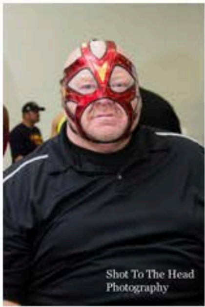
Shot To The Head Photography