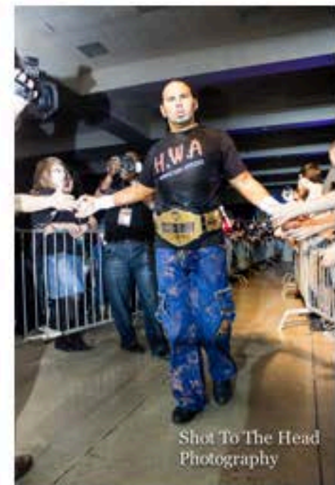
Shot To The Head Photography