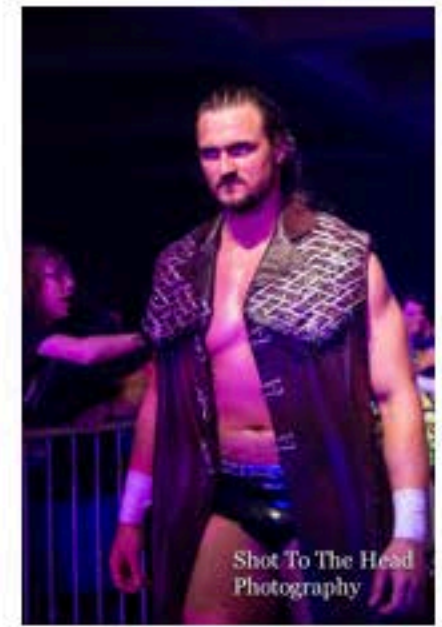
Shot To The Head Photography